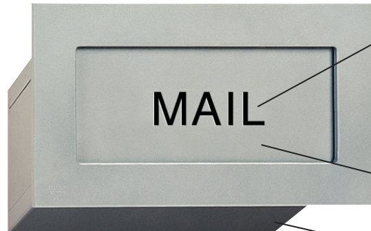
2255 with optional custom black filled engraving (#2266) displayed

Constructed of 1/4" thick aluminum plate and 20 gauge steel, Salsbury recessed mounted mail drops feature a spring-loaded mail flap and an adjustable mail flap stop. Mail drops also feature a durable powder coated finish available in five (5) contemporary colors. Custom engraving (#2266) is available as an option upon request. An optional receptacle (#2256 - see page 31 - order separately) aligns with the mail drop chute for receipt of deliveries. Mail drops are ideal for collecting documents and small packages and may be used for U.S.P.S. residential door mail delivery.