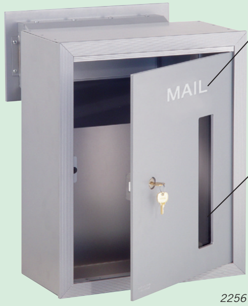
2256 Receptacle with mail drop (#2255) displayed

order mail drops and receptacles separately