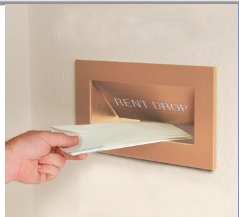
#2255 with optional custom regular engraving (#2266) displayed