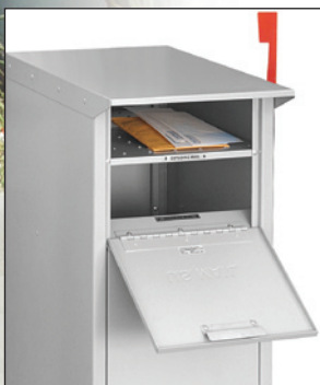
Front view of #4375 displayed