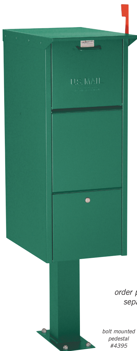
bolt mounted pedestal #4395