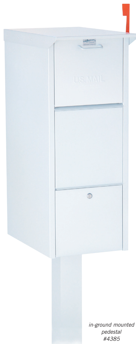
in-ground mounted pedestal #4385