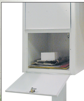
Rear view of #4375 displayed