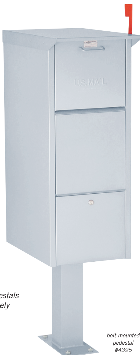
bolt mounted pedestal #4395